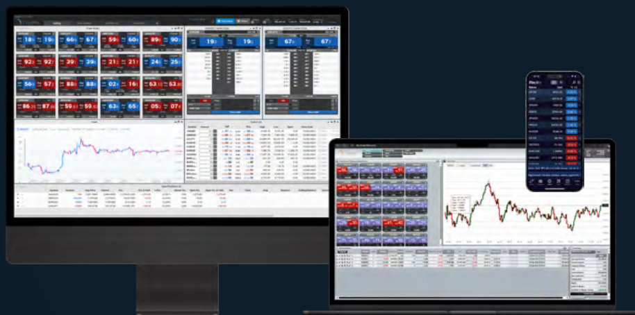
*Instruments and prices for illustrative purposes only